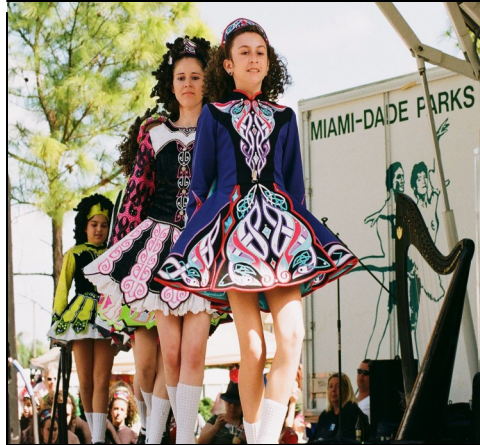
The Breffni Dancers at the 2011 Festival