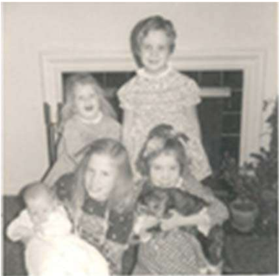
Merry Christmas and a happy new year!